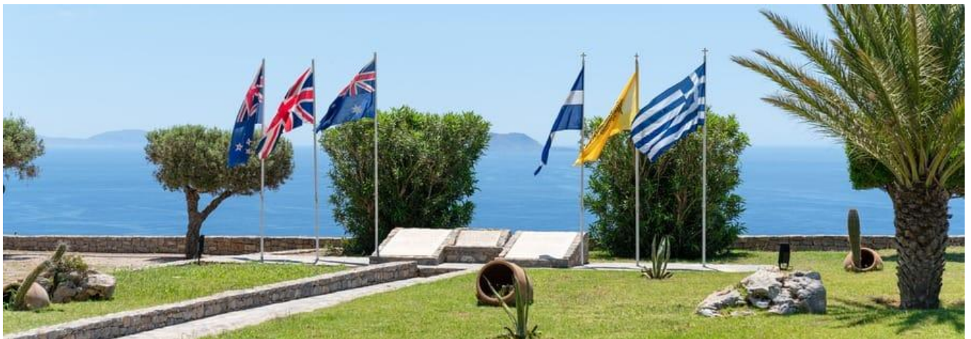
Monument Klooster Preveli

85 th Anniversary of the Battle for Crete 20 th June 1941