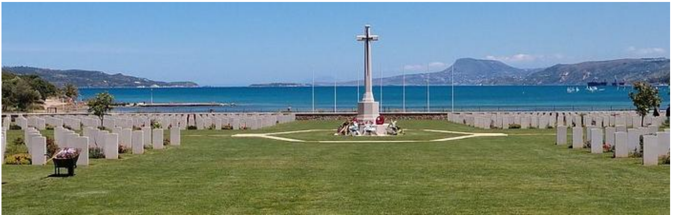
Suda Bay Commonwealth War Graves Memorial Cemetery