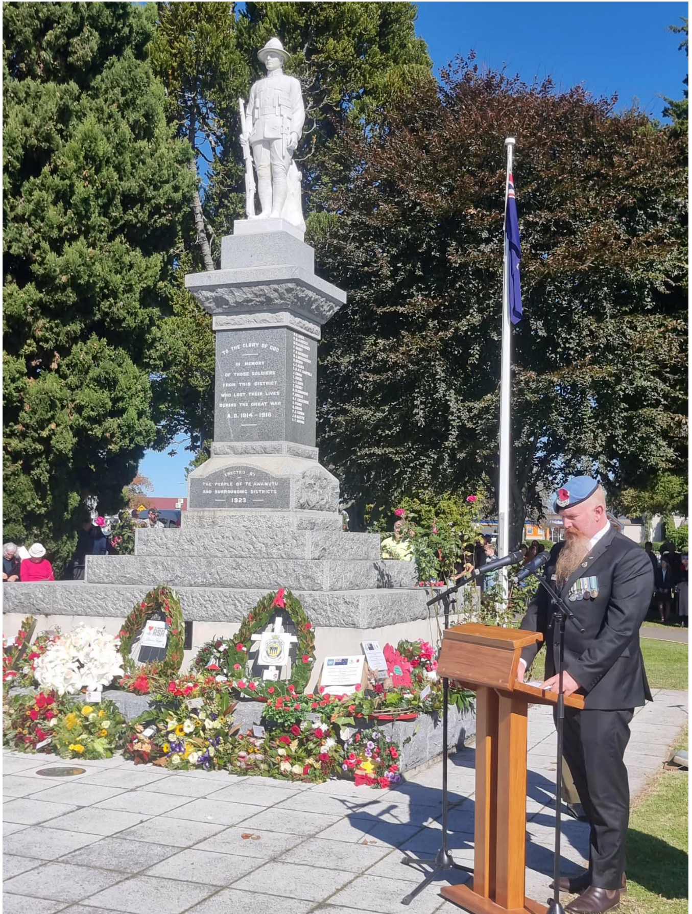
RSA President at ANZAC Green Cenotaph